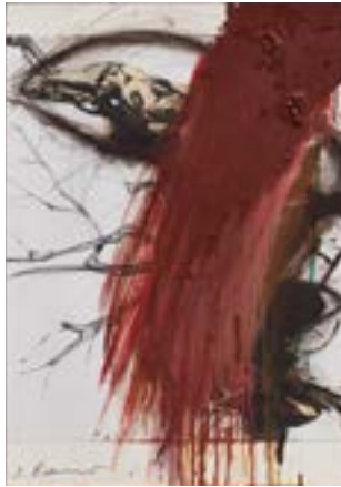
Arnulf Rainer, Untitled , 1986. Oil, pastels and oil on photo on wood, 77.5 x 95 cm

Arnulf Rainer: Paintings, Drawings, and Books