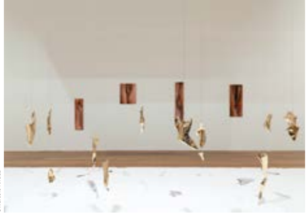
Marcia Pastore, Crevices and Machine , 2003/2019, polished bronzes, polyester plaster, resin, steel cable, pulleys and hooks, variable dimensions © Marcia Pastore