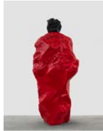
Rondinone Ugo, black red nun, 2020, Painted bronze, 300 x 114.5 x 126 cm / 118 inches x 45 inches x 50 inches, Ugo Rondinone, Courtesy the artist and Galerie Eva Presenhuber, Zürich / New York