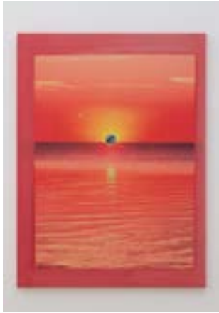
Spichtig Tobias, Weltuntergang, 2020, Vinyl print and oil on canvas, 195 x 145cm © Spichtig Tobias and Galerie Bernhard, Zürich