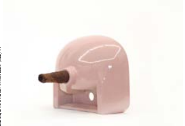
Plug, 2018 Ceramic bathroom sink, hand-collaged, pigments