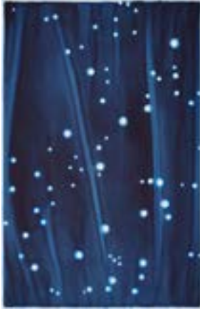
Slawomir Elsner, Virgo from the Series of Night Pieces, 2020, Watercolour on paper, 108 x 110 cm © The artist and Lullin + Ferrari