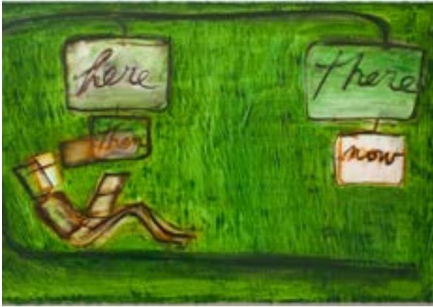
Schor, Mira, Here/There/Now , 2011, 45.7 x 76.2cm, ink, oil and gesso on linen © Mira Schor, Courtesy the artist and Fabian Lang, Zürich