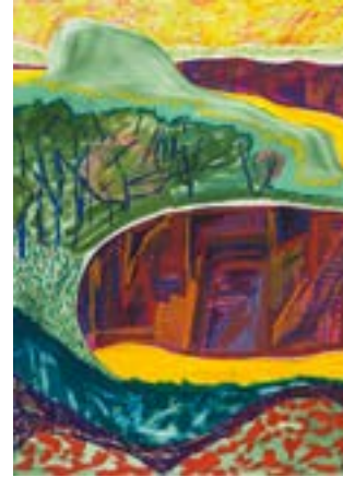
Hughes, Shara, Trying To Stay Clean , 2019. Printed ink and mixed media on paper. © Shara Hughes. Courtesy the artist and Galerie Eva Presenhuber, Zurich / New York