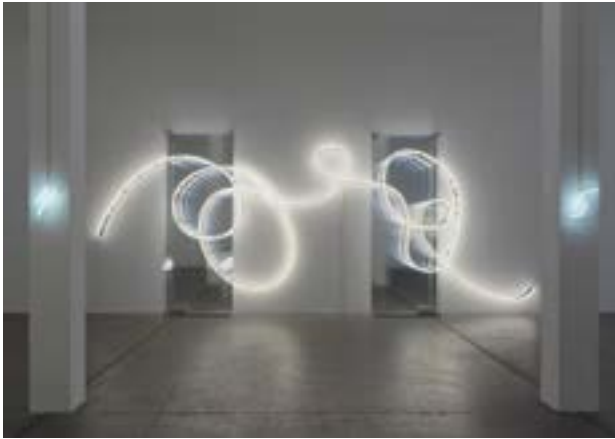
Installation view Museum Haus Konstruktiv, 2020. Photo: Stefan Altenburger, © 2020, ProCultura, Zürich; Studio Brigitte Kowanz

Lost under the Surface | Brigitte Kowanz