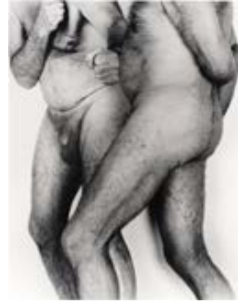
John Coplans, Double Self Portrait , 1990, silver gelatin print, 66 x 78 cm, Courtesy the artist and Galerie Peter Kilchmann