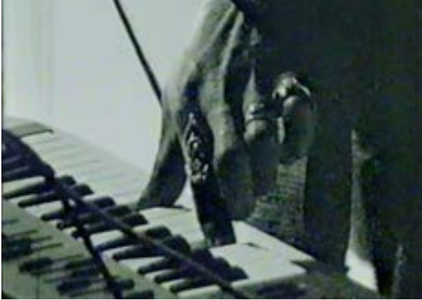
Rammellzees, opening concert at Galerie Renée Ziegler, 1985 Video still from https://www.youtube.com/watch?v=lighta0dc3gk

RAMM:ΣΛΛ:ΖΣΣ "1985" In memory of Rammellzee (1960-2010)