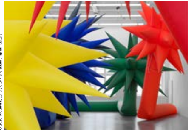
Installation view, Museum Haus Konstruktiv, 2020.