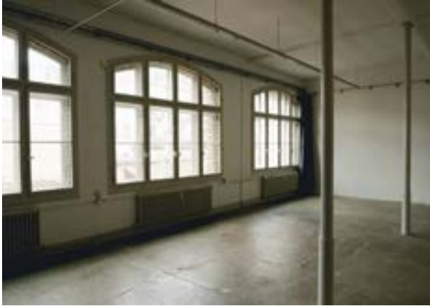
Oncurating Project Space