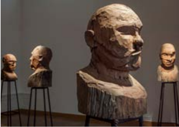
Kader Attia, Culture: Another Nature Repaired, 2014, Ausstellungsansicht, Musée d'Art et d'Histoire, Lausanne, 2015 Foto: Nora Rupp, Courtesy of the artist, © 2019 Proletaria, Zürich