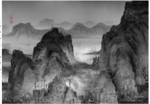
Yang Yongliang (*1980), Phantom Landscapes, 2010. Video, DSLR Collection, Paris