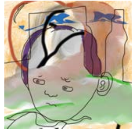
Vittorio Brodmann, Untitled , 2020