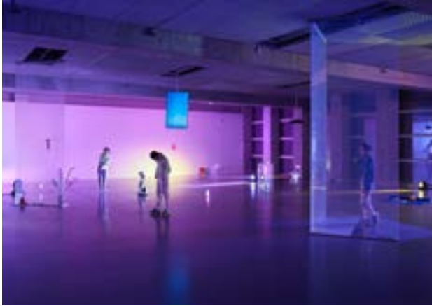
Nile Koetting, 保持冷静 | Remain Calm, 2019, installation view at Centre Pompidou x Westbund Museum, Photo: GRAT SC

Remain Calm ( Reduced + ) | Nile Koetting