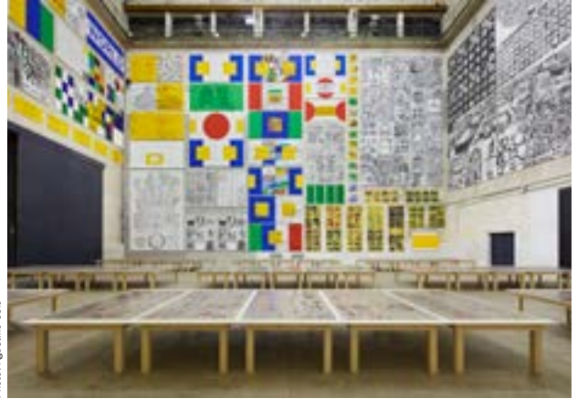
Installation View, Matt Mullican, "The Feeling of Things", exhibition view at Pirelli HangarBicocca, Milan, 2018.