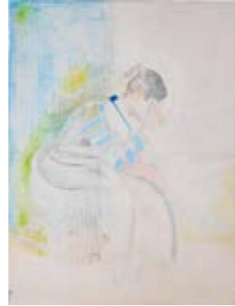
Sophie Reinhold, Hissings, 2019/20, oil on marble powder on jute, 80 x 60 cm.