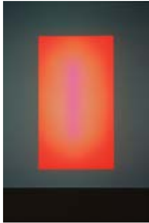
Turrell James, "Flat Glass", 2007 | Glass, LED | Frame: 335.33 x 215 x 65 cm.