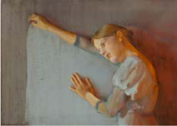
Gabi Hamm, Untitled , 2018/2020, oil on canvas, 42 x 58 cm, © Gabi Hamm

Fictional Portraits, Various Vases | Gabi Hamm Collector's Room | Selected works of private collections