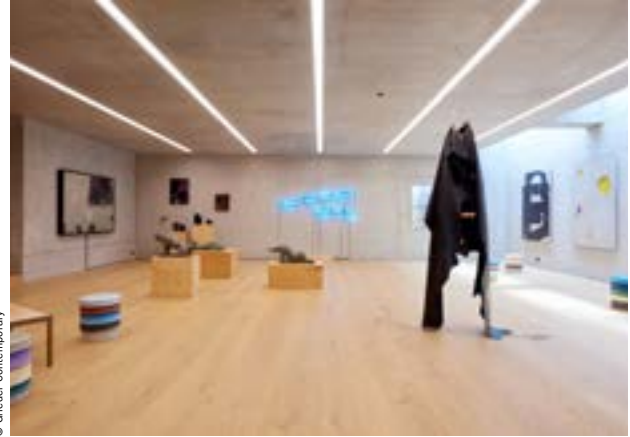
Installation view, Made in Zürich