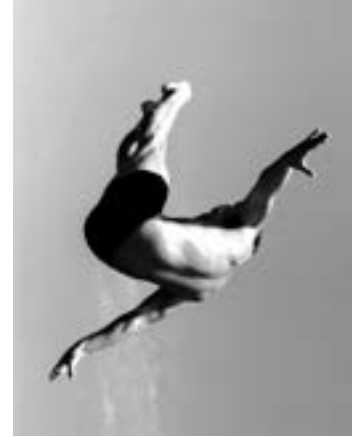
Shirana Shahbazi, [Diver02-2011], Kunsthaus Zürich, 2015, © Shirana Shahbazi

July 3 to Oct 11, 2020 Fri, Sept 11, 10:00–18:00 Sat, Sept 12, 10:00–18:00 Sun, Sept 13, 10:00–18:00