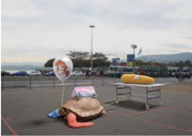
Darren Bader, Mundi #56, (Zürich render), augmented reality sculpture, dimensions variable.